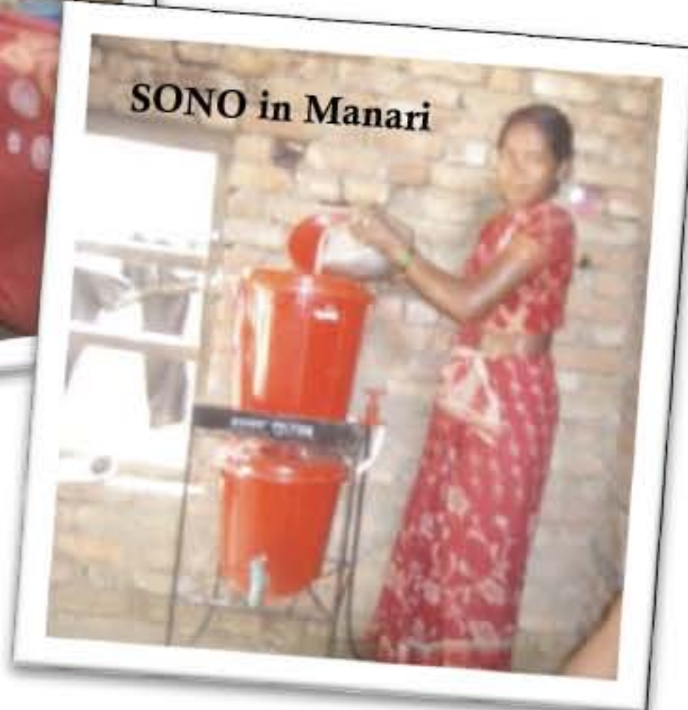
SONO in Manari