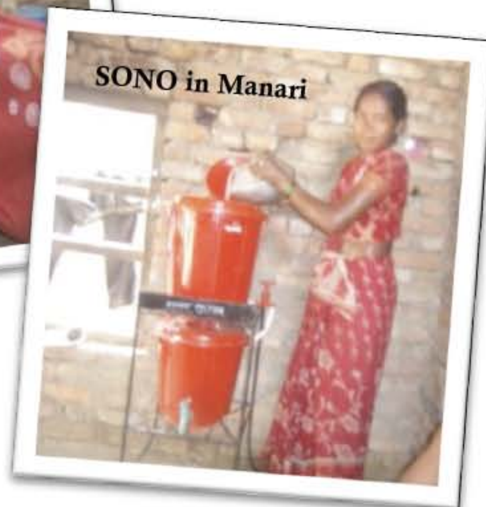
SONO in Manari