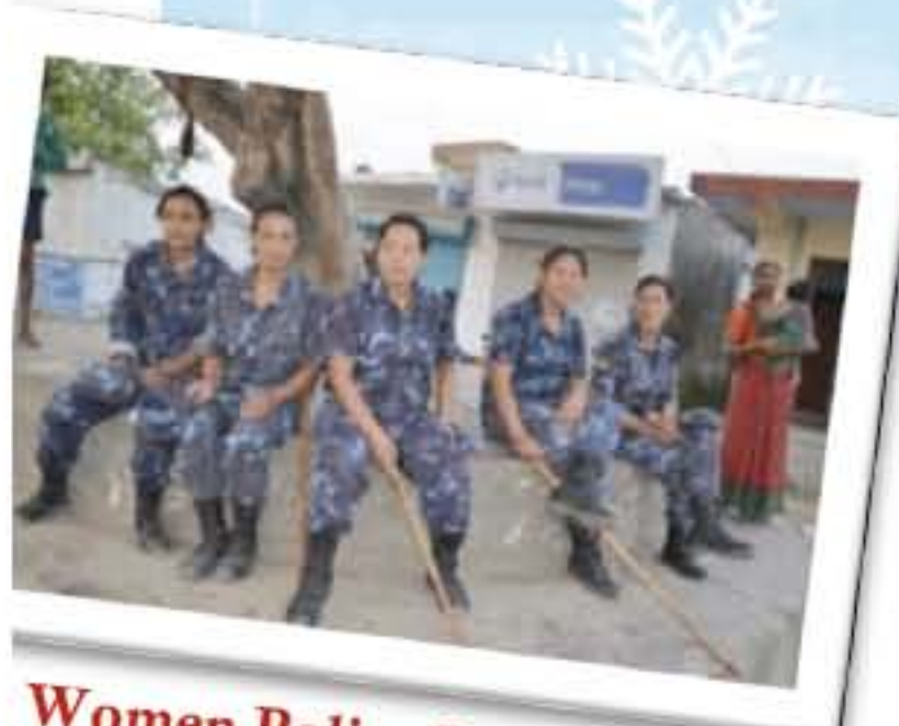
Women Police Unit in Parasi, 2012