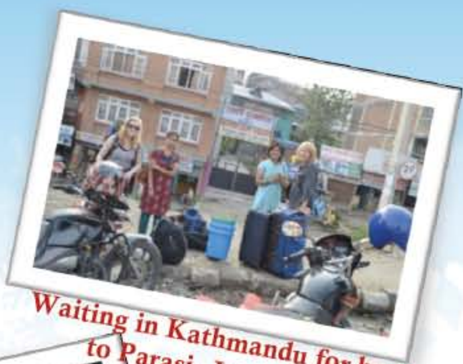
Waiting in Kathmandu for bus to Parasi, June 2012