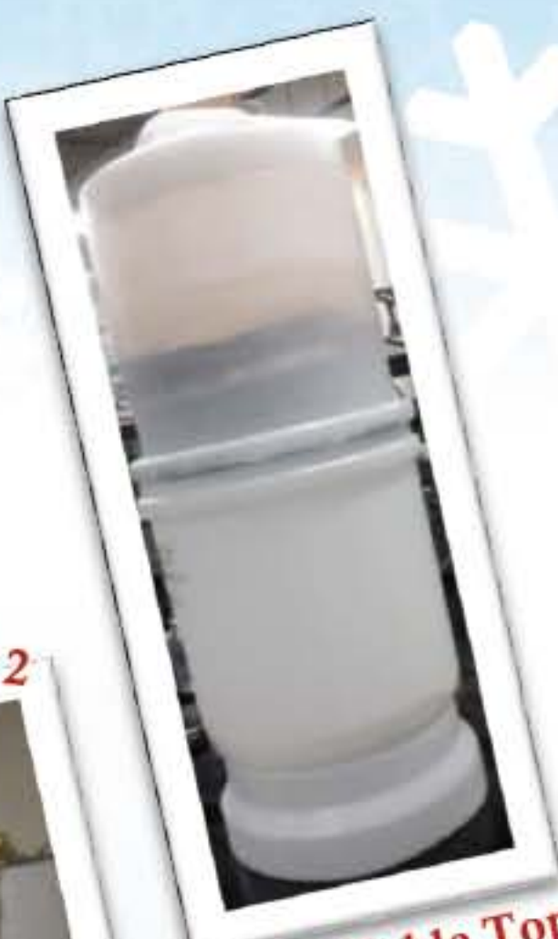
SONO Table Top Model for Sioux Reservation