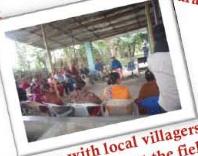
Meeting with local villagers and government officers at the field office filter factory