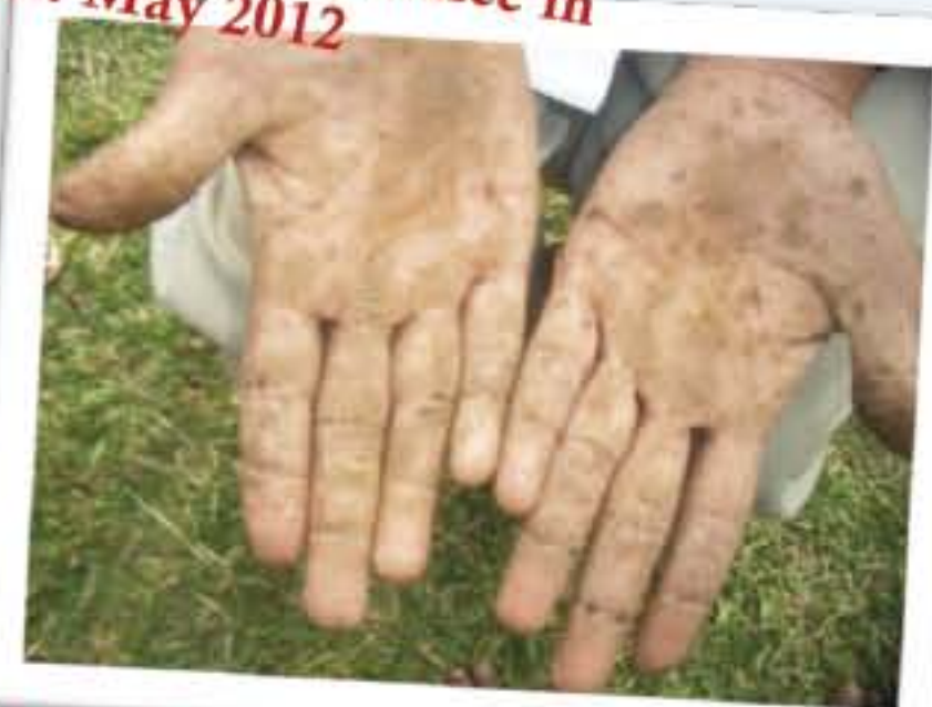
Keriosis from Arsenic poisoning in a local Brick worker.