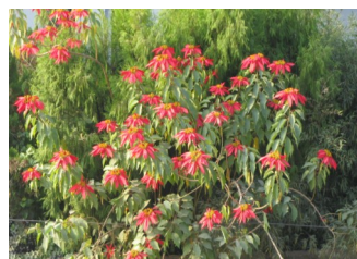
Poinsettia's growing outside the Kathmandu office in December.

we've given his mother along and other women in Nadawa, nutrition, health and sanitation training, he's still not getting enough